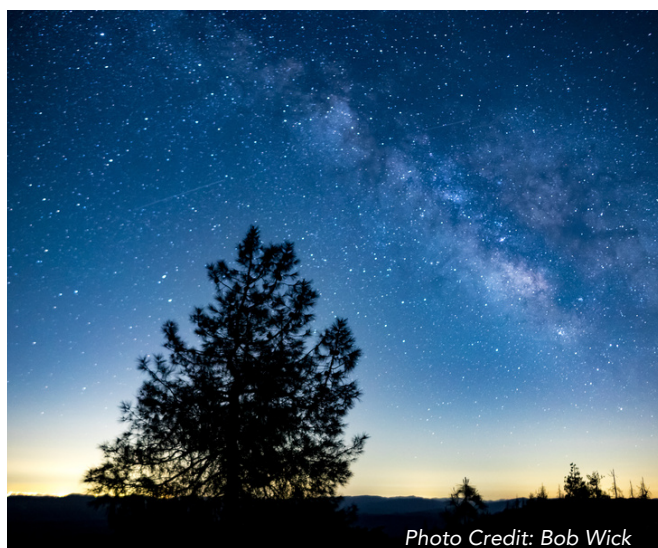
Milky Way from Condor Ridge

The expansion of Berryessa Snow Mountain National Monument would safeguard public lands that are sacred to the Yocha Dehe Wintun Nation.