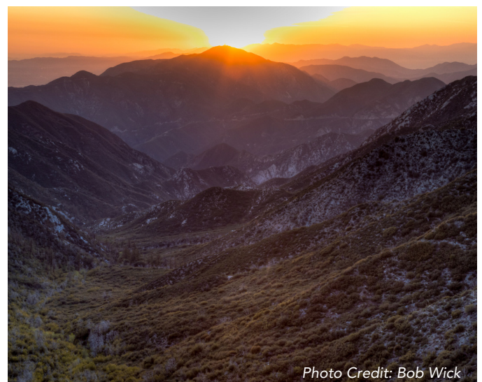
Bear Creek Canyon

Expanding the monument is the next step in a 20-year, locally-driven effort to protect the San Gabriel Mountains, an area known as the “gateway” to the Angeles National Forest. It is one of the most visited parts of the forest receiving 4.6 million visitors in 2021—more than either the Grand Canyon or Yosemite National Park.