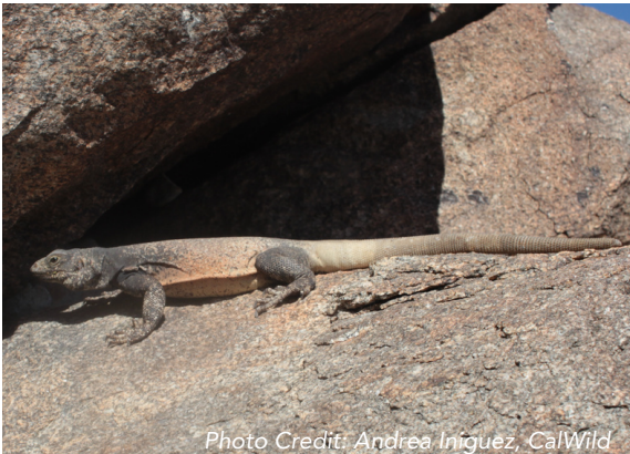
A chuckwalla lizard at Corn Springs Campground

The monument would permanently protect approximately 660,000 acres of federal public lands that reach from the Coachella Valley region in the west to the Colorado River in the east. Designating the Chuckwalla National Monument would help ensure equitable access to nature, honor a cultural landscape, and protect the desert's unique biodiversity, wildlife habitat and landscape connectivity, and history.