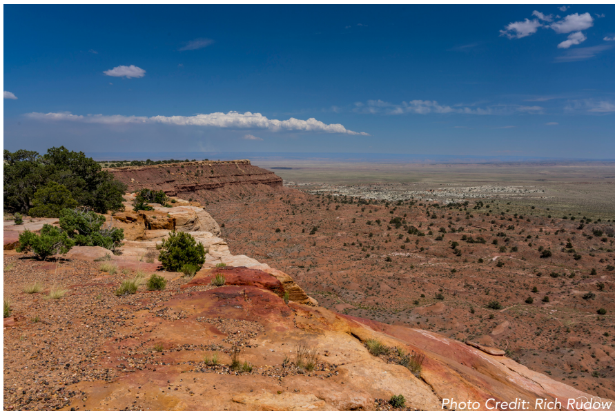
Baaj Nwaavjo I'tah Kukveni - Ancestral Footprints of the Grand Canyon National Monument

On August 8, 2023, President Biden designated the tribally-led Baaj Nwaavjo I'tah Kukveni - Ancestral Footprints of the Grand Canyon National Monument to protect lands around the Grand Canyon region and watershed, which have cultural connections to at least 12 Tribes and Nations.